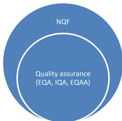
Figure 1: NQF incorporates QA

However, Bateman and Coles (2016, p. 14) indicated that in some cases an ‘NQF is simply seen as a catalogue or classifier of all qualifications in a country’ with little reference to the quality assurance arrangements of these qualifications. Coles (2016) expands on this notion in a recent paper and notes that it is possible to view ‘quality assurance processes and their governance as independent of the national framework’ and that it is ‘possible to conclude that a NQF can work to support quality assurance but is not necessarily central to it’. 10