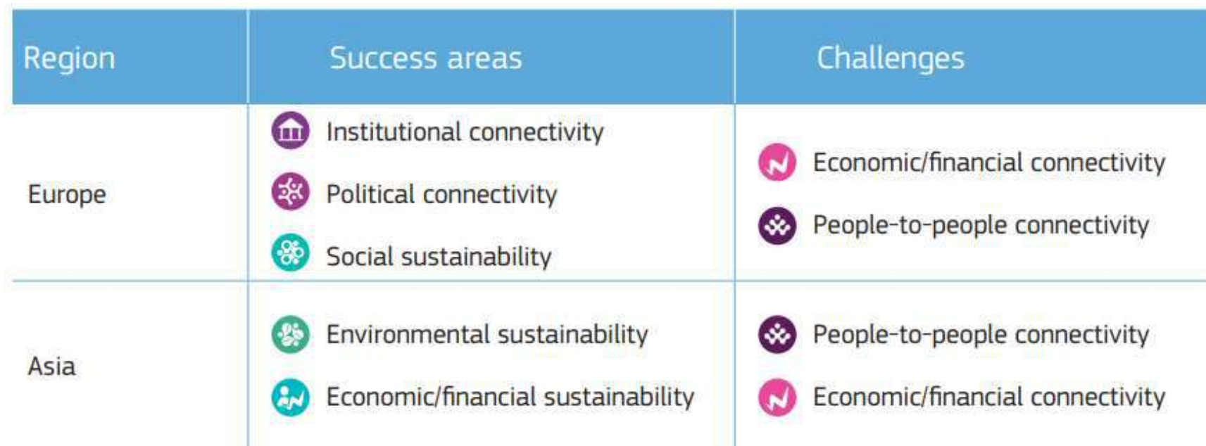
Figure 48. Successful areas and challenges by geographical region